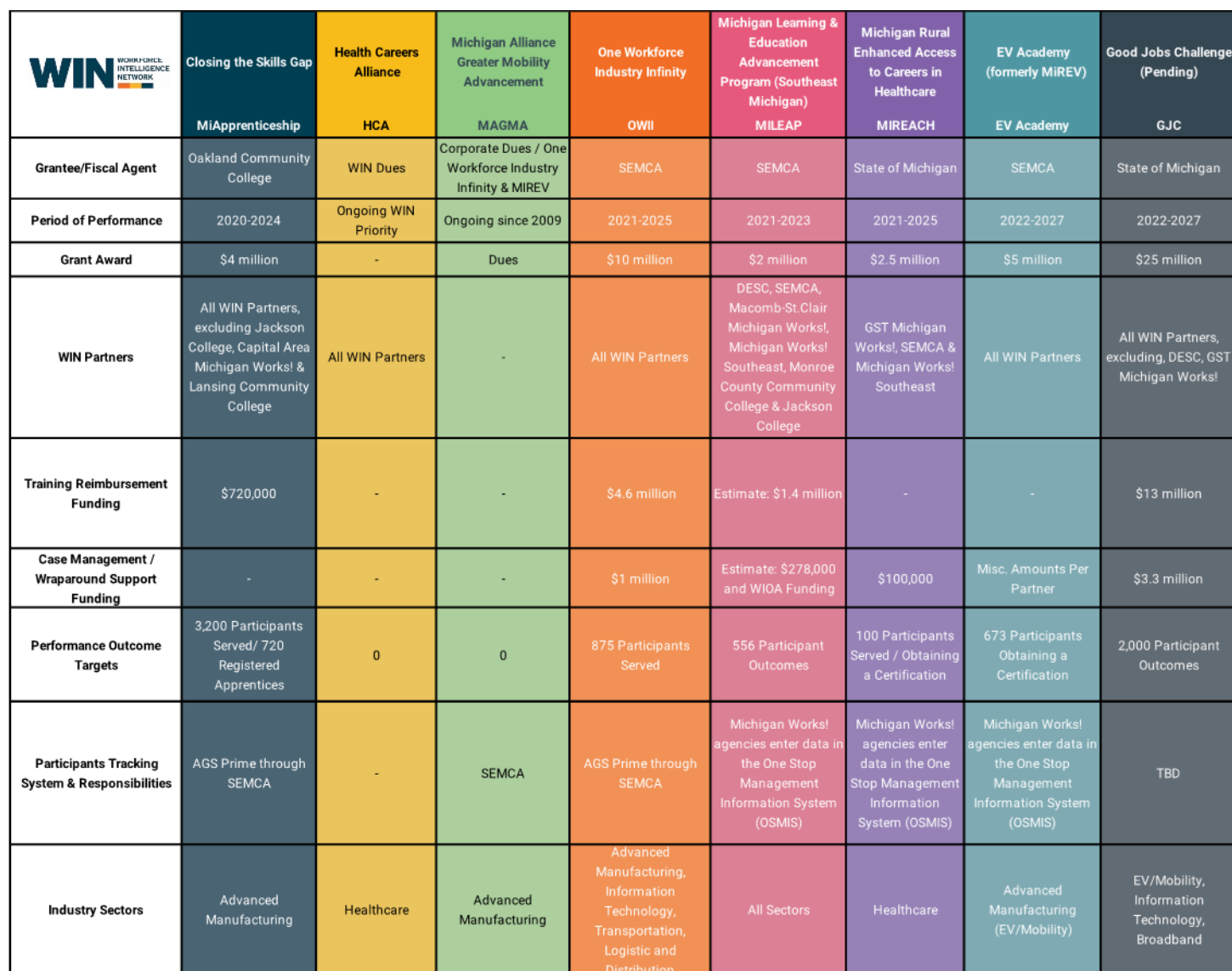
Figure 24: WIN 2022 Matrix of Initiatives

Michigan Alliance for Greater Mobility Advancement (MAGMA): is a consortium that includes five original equipment manufacturers (OEMs), five tier one manufacturing suppliers, educational institutions, workforce organizations, and state government to address automotive industry skills requirements and training resources, particularly around connected and autonomous vehicles. The initiative was established in 2009 by the State of Michigan Workforce Development Agency (WDA), along with automotive manufacturing employers and educational institutions. Since 2013, WIN has convened and facilitated MAGMA, which aims to better assist Michigan's rapidly changing automotive industry as it moves towards connected and autonomous vehicles, cybersecurity, embedded software systems, and other emerging technologies. All WIN partners are permitted to attend MAGMA Advisory Council meetings which are held on a quarterly basis with subject matter experts speaking on key topics affecting the region.